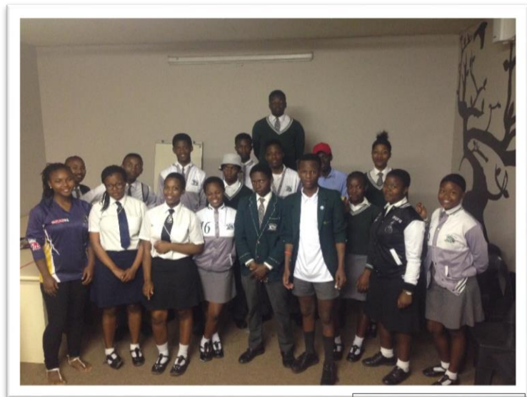
Some of our Gr12's

Centre closes on 2 December & opens again on 11 January 2017!